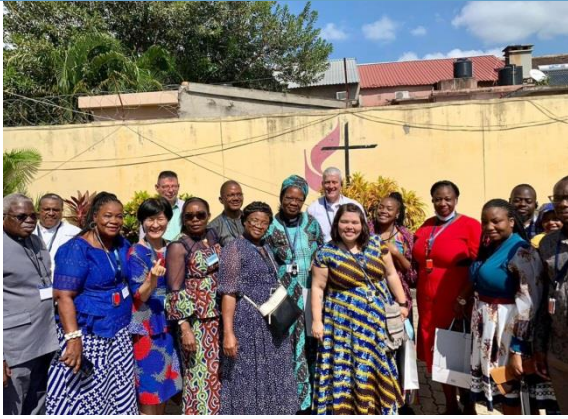
Maputo Mozambique. April 2023

During the missionary meeting, we shared experiences with missionaries who serve in similar or different situations to ours. The regional meeting in Maputo – Mozambique was a memorable time where missionaries were reinvigorated in our call to service in mission.