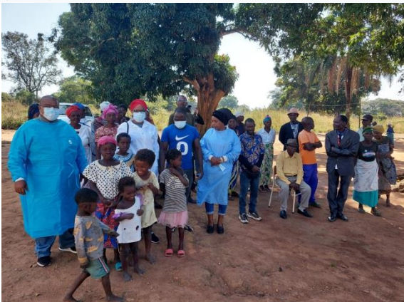
Mobile clinic of the Quessua Health Team in the Quimbanba community. May 2023

The implementation of multi purpose mobile clinics in remote communities enables community interventions for the prevention, diagnosis and timely treatment of malaria, through the Imagine No Malaria Program (INM).