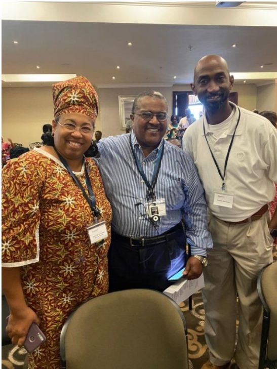
Maputo Mozambique April 2023

Malaria still continues to be the main cause of morbidity and mortality in Angola. Forms of Malaria that receive incomplete treatment evolve into chronic forms of the disease.