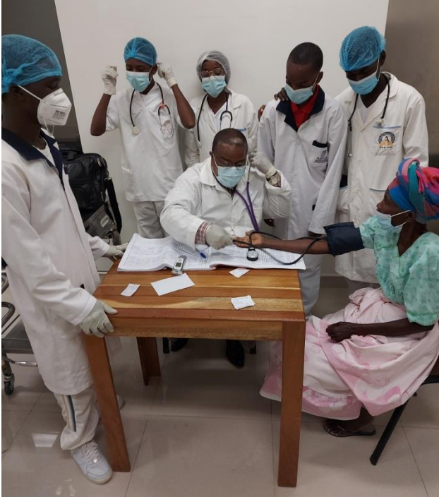
Teaching Students who perform at the Hospital in Quessua Mayo 2023.

The health technician students who are in train during their rotation period at the Hospital of Quessua, learn about techniques and procedures to carry out the physical examination of the patient and obtain better diagnostic guidance.