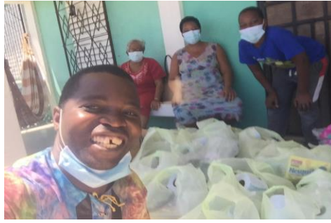
Groceries to families affected by Covid-19 and family whose house was burned.

3). Pray for my family and our Churches as we as we become the true Ambassadors of Christ.