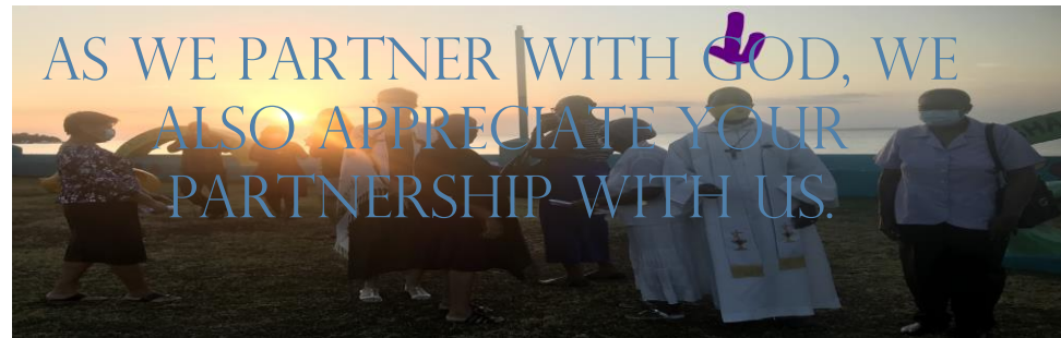
The Lenten experience through