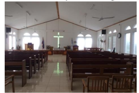
Easter at Corozal.