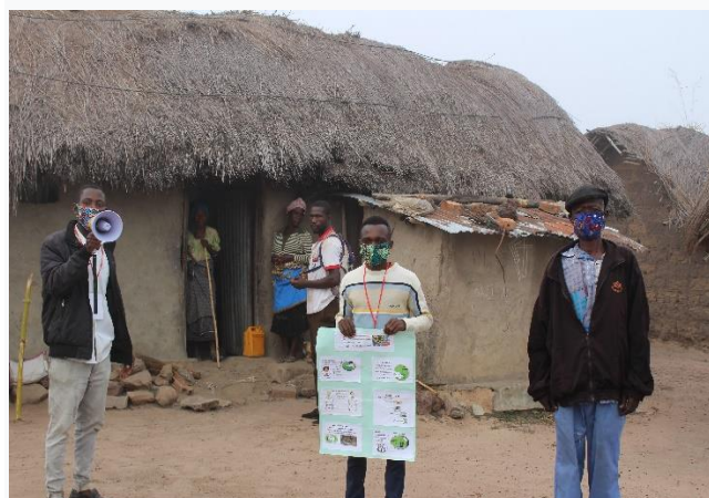
Volunteer Assistants giving health education in Mufongo village.

On arrival in the villages, the Volunteer Assistants go from house to house, offering health education on such subjects as hand washing, respiratory hygiene and social distancing.