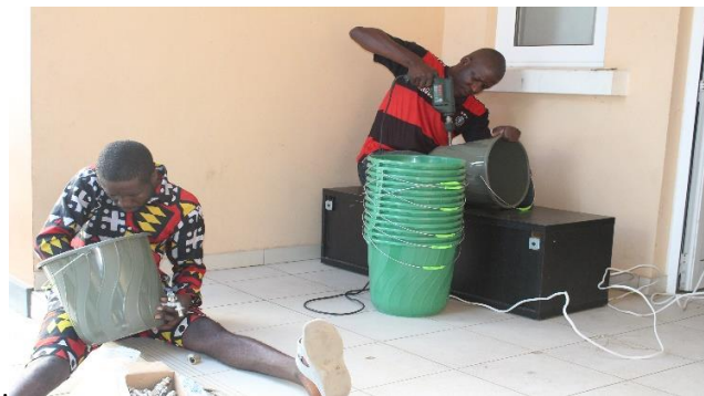
The team of volunteers working at the Quessua Mission to prepare the buckets for use in the project.

We acquired 1000 buckets for water which then had to be modified, fitting each one with a faucet, so that water might be stored in the homes of families who do not have ready access to this precious liquid.