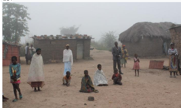
Families in the village of Cassucina listening to the message of prevention against COVID-19

When the families hear the loudspeaker, they come out of their houses, practicing the social distancing prescribed by the health authorities of the country. All of them attentively receive the instructions to protect themselves from COVID-19.