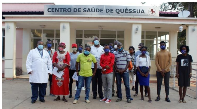
State Health Team from East Angola working together with the team of Volunteer Assistants and leaders of the community of Quessua.

It is in this African land where I continue to serve my Lord through my contribution as Doctor in Medicine, offering consultations in Internal Medicine at the Health Center in Quessua, Province of Malanje in Angola.