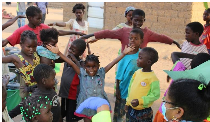
Mbango village: the children also learn to maintain social distancing.

The children also learn about the importance of keeping one meter of distance between them