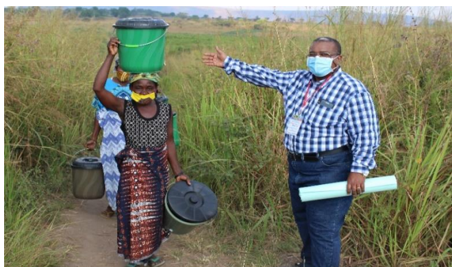
Women from Mbango village walking to the river.

Before the Health Team leave the villages they have visited, the women are already going to the nearest river to get water, using the donated buckets