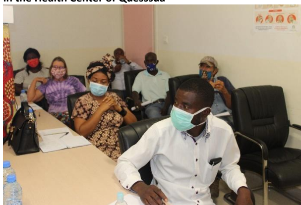
Training of other community leaders in the Health Center of Quessua.

Training these Volunteer Assistants has been for me a powerful experience of fraternal sharing and solidarity. They are now ready to help transform the residents of Quessua into families who will care for their health through their faith and through preventive measures against COVID-19. On this occasion, material resources were available, as well as the willingness of the Angolan Christian Youth to work for preventive measures of health.