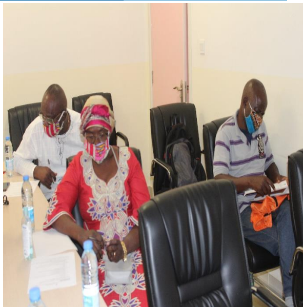
Training of the pastors of the United Methodist Church.