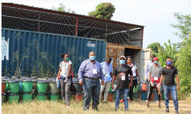
The Health Team protects the resources acquired for the project, putting them in the Community Warehouse in Quessua.

We acquired 1000 buckets for water which then had to be modified, fitting each one with a faucet, so that water might be stored in the homes of families who do not have ready access to this precious liquid.