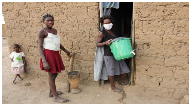
Families of Mbango village making use of the donated items.

Thought the donated items, many of the families can have in their houses water to wash their hands.