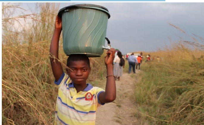
A child from Mbango village, coming back from the nearest river.