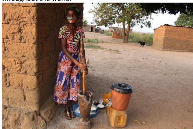
Families from Mbango village using in their homes the buckets filled with water.

All that we see here, and to which I bear witness, is God's answer, fruit of the intercessory prayer of many Christians throughout the world.