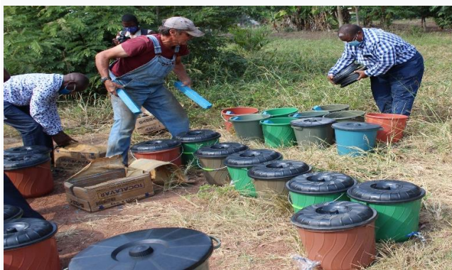
All are getting ready for the distribution, putting the bars of soap in the buckets before going out to the villages.

In keeping with the preventive measures to combat COVID-19, we also bought enough bars of soap so that all the families in the villages can wash their hands often. Combined packages of buckets and soap are being taken to the neediest communities.