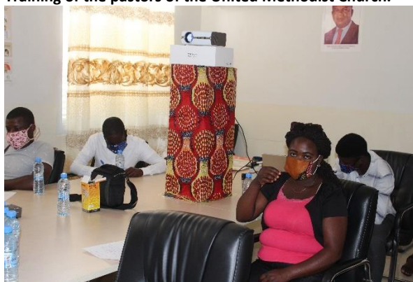
Training of the youth of the Central United Methodist Church in the Health Center of Quessua