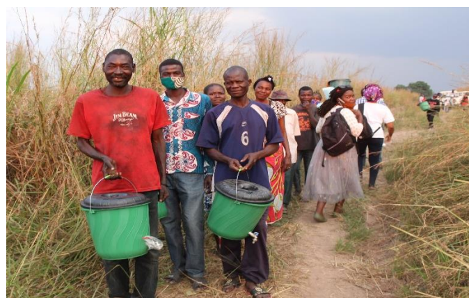
Adults from the village families, using the donated buckets.

"Nevertheless, I will heal my people and Will let them enjoy abundant peace and security" (Jeremiah 33: 6)