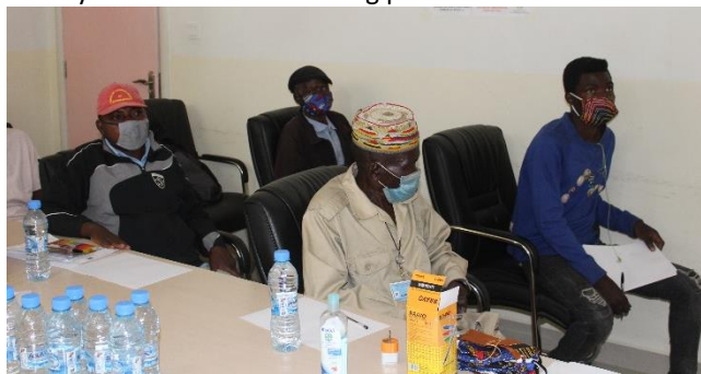
Training of the "Sobas" or village chieftains.

From the month of April until now, our Health Team, together with community leaders such as the pastors; the youth of the Central United Methodist Church of Quessua; the "Sobas", that is, the chieftains of the different ethnic groups in the villages around Quessua; the government authorities at the municipal and provincial levels all of us were participating in seminars of Sanitary Education, as may be seen in the following photos: