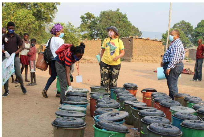
Volunteer Assistants and community leaders distribute the buckets and soap after giving Sanitary Instruction in the village of Mbango.

For me personally, training the Volunteer Assistants and the leaders of the community has been a powerful experience. I have learned about fraternal spirit and solidarity which grow in the face of the pandemic of COVID-19.